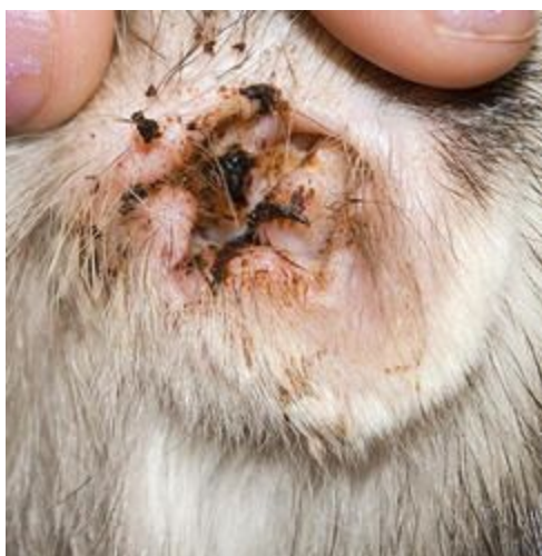
Ear Mites in the ear canal

https://www.lovethatpet.com/dogs/grooming/cleaning-your-dogs-ears/